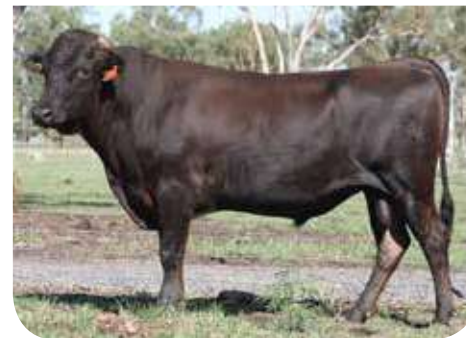
TAMARIND T4 KANADAGENE 14/2 (AI)

PEDFA201 MONJIRO J11550 WKSFM0164 WORLD K'S MICHIFUKU PEDFA215 MICHIKO J655635 (AI) Sire: WKSFPC100 WORLD K'S KANADAGENE 100 (AI) (ET) PEDFA211 TANISHIGE 1526 - KURO KOH WKSFL0976 WORLD K'S SUZUTANI (FB1617) PEDFASUZUNAMI SUZUNAMI 472255 Animal: KT4FK1888 TAMARIND T4 KANADAGENE 14/2 (AI) PEDFAJ1742 TERUNAGADOI 1742 IMFAJ2810 KITATERUYASUDOJ J2810 HONGEN (IMP JAP) PEDFAJ601124 YOSHIMI 3 601124 Dam: KT4FA0200 TAMARIND T4 HIKOHIME 05/2 (AI) (ET) WKSFM0139 WORLD K'S HARUKI 2 (FB1614) HWDFT0002 HARWOOD HIKOHIME - 1 (AI) (ET) IMUFR3256 TF HIKOHIME 34/3 (IMP USA) (ET)