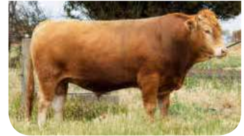
Bald Ridge Henshin

SHIGEMARU 2124 (USA) HEARTBRAND RED STAR AKIKO Dam: KALANGA STARMIKO B218 HB BIG AL Q502 KALANGA ALMIKO (USA) HEARTBRAND T0506E