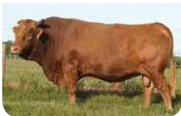
Big AL (Sire)