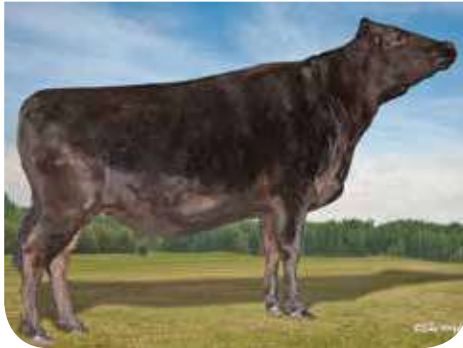
WSI Kanadagene M256 (Dam)

PEDFA201 MONJIRO J11550 WKSFM0164 WORLD K'S MICHIFUKU PEDFA215 MICHIKO J655635 (AI) Sire: WKSFPC100 WORLD K'S KANADAGENE 100 (AI) (ET) PEDFA211 TANISHIGE 1526 - KURO KOH WKSFL0976 WORLD K'S SUZUTANI (FB1617) PEDFASUZUNAMI SUZUNAMI 472255