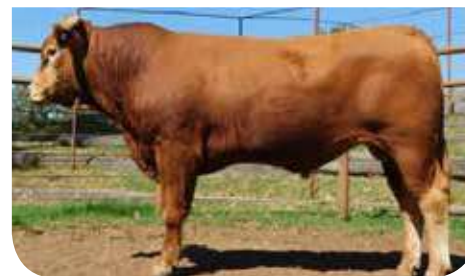
Bald Ridge Tamamaru

PEDFA419 TAMANAMI 70 PEDFA444 DAI 5 TAMANAI 96 PEDFA420 FUJIMITSU 2030 Sire: IMUFN2125 TAMAMARU (IMP USA) PEDFA415 DAI 3 MITSUMARU 30 PEDFKU2454 DAI 8 MARUNAMI FB2454 PEDFAJ14289 DAI 7 MARUNAMI 14289 Animal: CCCFM0128 BALD RIDGE TAMAMARU M0128 (ET) IMUFN2455 HIKARI J251830R (IMP JAP) TWAFS0363 TWA KAJIKARI (AI) (ET) PEDFM251352 UME MTA 251352 Dam: KALFC0767 KALANGA F C767 (AI) (ET) IMUFQ0502 HB BIG AL Q502 FB2998 KALFV2277 KALANGA ALMIKO V2277 (AI) (ET) PEDFMU2118 NAMIKO