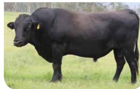
Sumo Itoshigenami C0158

YUKIZAKURA J456691 Animal: SUMO CATTLE CO ITOSHIGENAMI C0158 MONJIRO WORLD K'S MICHIFUKU MICHIKO Dam: SUMO MICHIFUKU U2208 (AI) (ET) TF KIKUHANA TF DAI 2 KINNTOU 35/3 TF DAI 2 KINNTOU 3