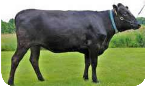
Hiko 35C - Dam of embryos