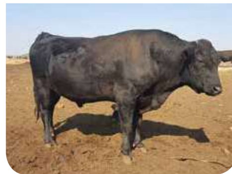
Kirstein Prime Cut PK140004

ITOKITAZURU J1081 ITOZURUDOI TF151 YASUHIME J433313 Dam: LAKE WAGYU D030 WORLD K'S MICHIFUKU CAMPANELLA ITO MICHI (ET) TWAFS0238 TWA DONO