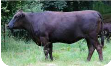
Stonyrun Shig Hikora 15 (Granddam of embryos) Sold for $US56,000