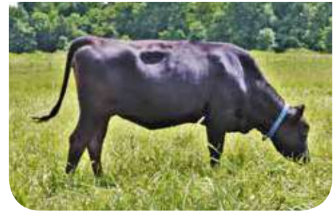
Stud MS Itoshigefuku 407 (Dam)