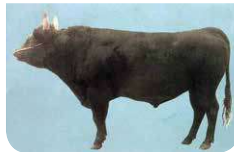
TF Kinuyasu Doi

PEDFAJ472 YASUTANI DOI J472 - KURO IKU PEDFAJ1606 TANIFUKU DOI J1606 PEDFAJ978542 KIKUTSURU J978542 Sire: PEDFX456 KIMIFUKU 3 PEDFAJ10787 KIKUTERU DOI J10787 - KURO IKU PEDFV456 YUKIFUKU PEDFT456 MIYUKI Animal: TFWFM0248 TAKEDA FARM KINUYASU DOI (ET) PEDFAJ9285 KIKUNORI DOI J9285 - KURO IKU PEDFA301 KIKUYASU DOI 575 PEDFA304 MURAYOSHI J74233 Dam: PEDFL2460 TF KINU 1 PEDFA527 SHIROASA PEDFA513 KINU PEDFA547 UTA