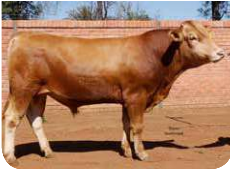
AL5 Virile L004 (ET)(AUS)