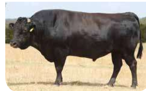
Sumo Michifuku F154