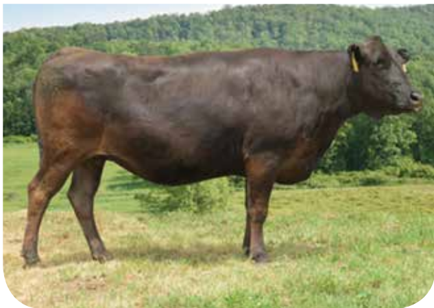
EFS Sanj 96