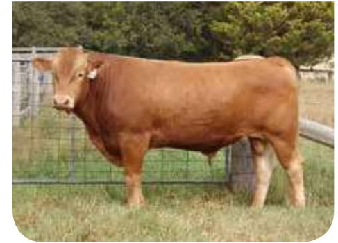
Academy Red Wagyu Tambo H18

TAMANAMI 70 DAI GO TAMANAMI 96 FUJIMITSU 2030 TAMAMARU B3F, CHSF, CL16F, F11F, F13F DAI 3 MITSUMARU 30 DAI 8 MARUNAMI J19461 DAI 7 MARUNAMI J14289 Sire: THE WRIGHT WAGYU TAMBO E161 DAI 2 SHIGENAMI SHIGEMARU B3F, CHSF, CL16F, F11C, F13F DAI YON AKIBARE 3357 KALANGA SHIGEHOMARE B234 B3F, CHSF, F11C, F13F HIKARI B3F, CHSF, CL16F, F11C, F13F KALANGA HIKAHOMARE VW36 RWA HOMARE BLUE 2 DAI 2 MITSUMARU DAI 10 MITSUMARU GODAI HB BIG AL 502 B3F, CHSF, F13F NAMIMARU AKIKO MITSUKO B 9639 Dam: COATES BIG AL E424 B3F, CHSF, F11F, F13F DAI 2 SHIGENAMI SHIGEMARU B3F, CHSF, CL16F, F11C, F13F DAI YON AKIBARE 3357 SUMO MARU W1232 JAPANESE COW (RED)