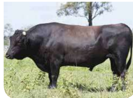
SUMO MICHIFUKU F126

PEDFAJ10328 YASUMI DOI J10328 - KURO IKU PEDFA201 MONJIRO J11550 PEDFA203 HARUMI J1086409 Sire: WKSFM0164 WORLD K'S MICHIFUKU PEDFA211 TANISHIGE 1526 - KURO KOH PEDFA215 MICHIKO J655635 (AI) PEDFA216 MICHIFUKU J4944290 Animal: SMOFF0126 SUMO CATTLE CO MICHIFUKU F126 (AI) PEDFA504 ITOHANA J809 IMUFN2294 TF ITOHANA 2 (IMP USA) PEDFA452 AINO 6 J674297 Dam: SMOFC0152 SUMO CATTLE CO HANA C152 (AI) (ET) WKSFM0164 WORLD K'S MICHIFUKU SUMFU2208 SUMO MICHIFUKU U2208 (AI) (ET) MUF3259 TF DAI 2 KINNTOU 35/3 (IMP USA) (ET)