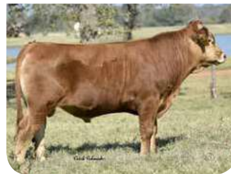
LAG Mr Honjo Masamune 1099

DAI 2 MITSUMARU DAI 10 MITSUMARU GODAI HB BIG AL 502 B3F, CHSF, F13F NAMIMARU AKIKO MITSUKO B 9639 Sire: HEART BRAND RED EMPEROR MITSUTAKE DAI 3 MITSUMARU 30 FUKUMARU 933 DAI 8 MARUNAMI J19461 DAI 10 SHIGEKAWA 65 DAI 7 MARUNAMI J14289 MARUNAMI MITSUTAKE DAI 2 MITSUMARU DAI 3 MITSU DAI 10 MITSUMARU DAI 5 SHIGEKAWA GODAI HATAURA Dam: KAEDEMARU F11F JAPANESE BULL (RED) DAI-SAN NAMIKI NI JAPANESE COW (RED)