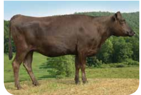
ESF Michi T-614-050 (Grandam)