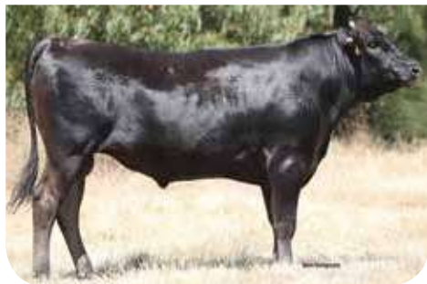
Macquarie Prelude M0495 (sire)