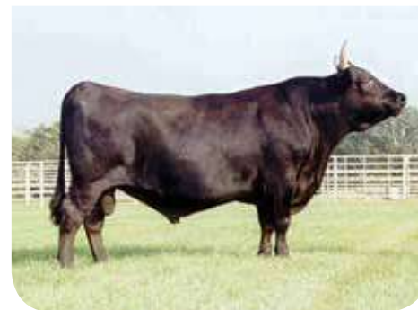
Hiashigetayasu J2351 Hongen