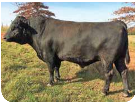
SHER ZURUSHIGE B119 - SWSFB0119

PEDFAJ65 DAI 7 ITOZAKURA J65 - KURO IKU PEDFAJ1081 ITOKITATSURU J1081 - KURO IKU PEDFAJ101266 NISHIZURU J101266 - KURO KOH Sire: IMUFLTF151 ITOZURUDOI TF151 (IMP USA) PEDFAJ10328 YASUMI DOI J10328 - KURO IKU PEDFAJ433313 YASUHIME J433313 PEDFAJ311983 FUJIHIME J311983 Animal: SWSFB0119 SHER ZURUSHIGE B119 (AI) (ET) PEDFAJ483 ITOFUJI J483 - KURO IKU IMUFQTF147 ITOSHIGEFUJI (IMP USA) PEDFAJ920752 DAI 30 NOBORU J920752 Dam: BYWFO224 BLACKMORE TETUFUKU Y224 (AI) (ET) IMUFQTF148 ITOSHIGENAMI (IMP USA) BYWFO235 BLACKMORE TETUFUKU V235 (AI) BYWFT0055 BLACKMORE TETUFUKU T055 (IMP USA) (AI) (ET)