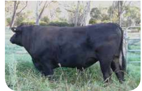
Westholme Hirashigetayasu Z278