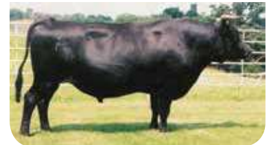
World K's Michifuku