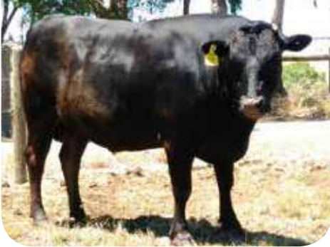
Peppermill Grove L0013 (AI)(ET)(TW)

PEDFA10632 SHIGESHIGENAMI J10632 IMUFQTF148 ITOSHIGENAMI (IMP USA) PEDFA661 FUKUYUKI Sire: ADBFA0139 MAYURA ITOSHIGENAMI JNR (AI) WKSFP0100 WORLD K'S SAN JIROU (AI) (ET) ADBFX0001 MAYURA DAI NI KINNTOU 1 (AI) ADBFW0028 MAYURA DAI 2 KINNTOU 7/2 (AI) (ET) Animal: PMGFL00013 PEPPERMILL GROVE L0013 (AI) (ET) (TW) PEDFA201 MONJIRO J11550 WKSFM0164 WORLD K'S MICHIFUKU PEDFA215 MICHIKO J655635 (AI) Dam: PMGFG0037 PEPPERMILL GROVE G037 (AI) TWAFR0007 TWA SHIKIKAN (IMP USA) (ET) PMGFE0023 PEPPERMILL GROVE E023 (AI) (ET) PMGFB0017 PEPPERMILL GROVE B017 (AI) (ET)