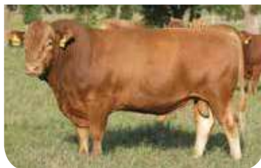
Joe S5394S (Dam sire)

PEDFA401 MITSUTAKE FB401/FB4062 PEDFAFB426 DAI 2 MITSUMARU FB426 PEDFAFB4063 DAI 3 MITSU FB4063 Sire: PEDPAMITSU DAI 10 MITSUMAU 76 FB424 PEDFAFB4064 DAI 5 SHIGEKAWA FB4064 PEDFAGODAI GODAI J2739R PEDFAFB4085 HATAURA FB4085 Animal: IMUFQ0502 HB BIG AL Q502 FB2998 PEDFA445 DAI 2 SHIGENAMI 27 PEDFANAMIM NAMIMARU J74R PEDFAMARUH DAI 2 MARUHANA J2862 Dam: PEDFA2120 MTA AKIKO FB2120 PEDFA401 MITSUTAKE FB401/FB4062 PEDFAFB438 MITSUKO B 9639 FB438 PEDFAMITSU1753 MITSU 1753