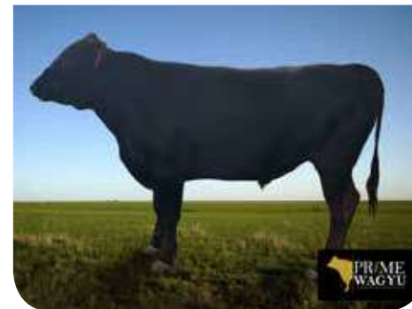
Poll Wagyu Midnight M0775 (ET)

JKCPR0078 ISLAND WAGYU 78 (IMP CAN) (ET) (P)