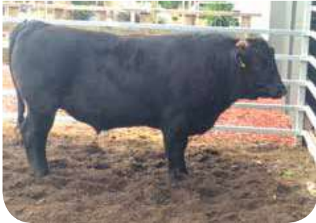
Cabassi Manifesto V1